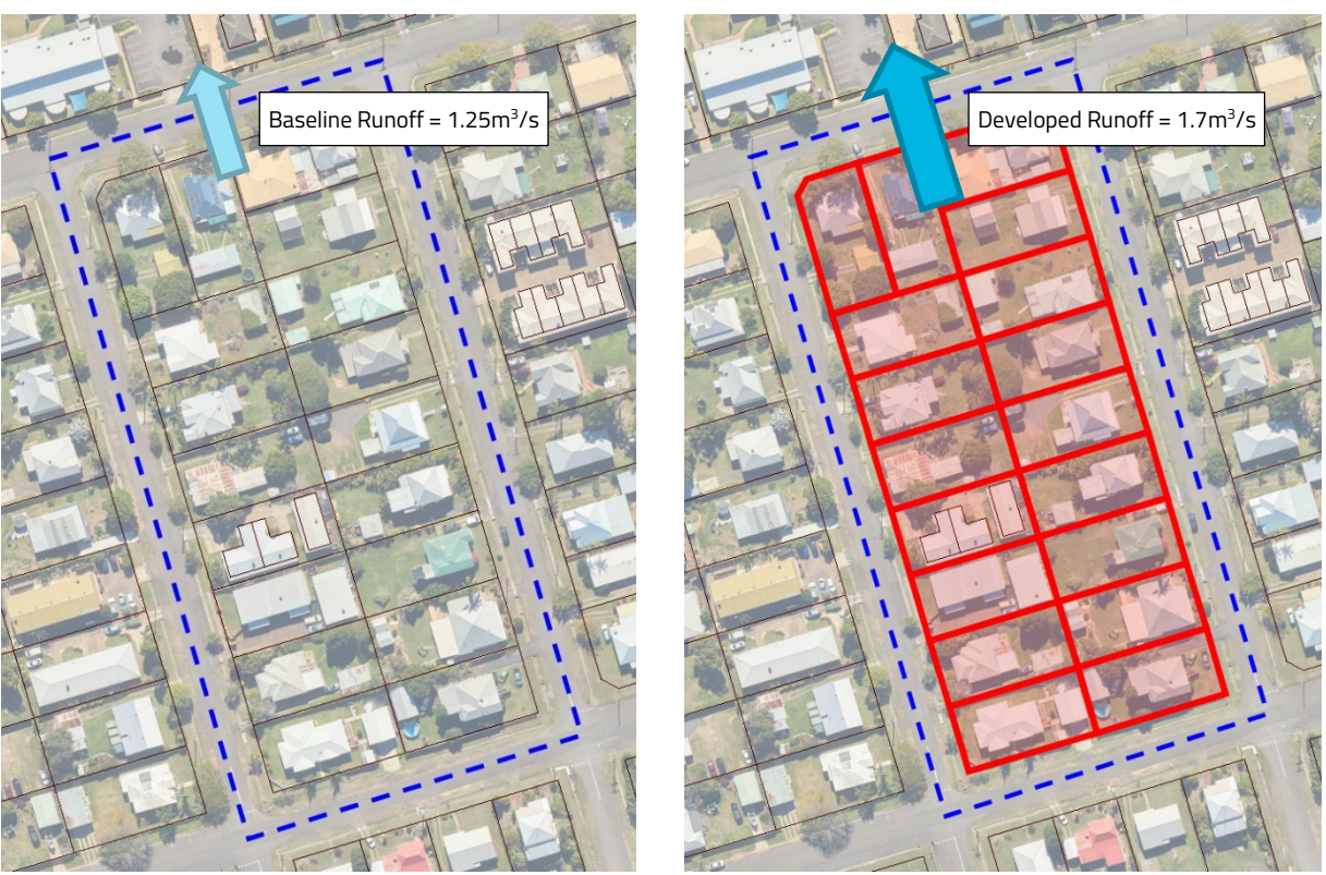
Figure 5 Example Scenario – Aggregate of Incremental Change in Local Runoff (Major Impact)