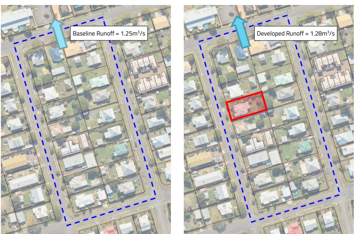
Figure 4 Example Scenario – Incremental Change in Local Runoff (Minor Impact)

Over a period of time, each individual property develops in the same manner, to a high density standard (multiple residential units), individually causing a relatively small increases in runoff (+25L/s) which when assessed individually, are deemed not to require mitigation measures (such as on-site detention).