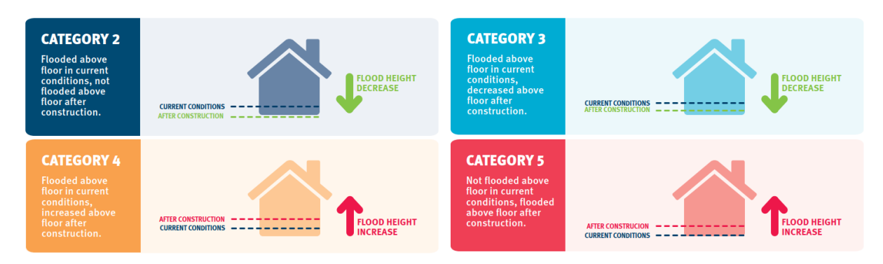
Figure 3 Change in Over Floor Flooding - Categories (Graphical)