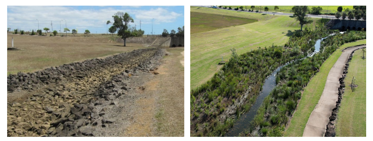
Figure 1 – Belle Eden Park Waterway Naturalisation – Before (Left) | After (Right)

Further details on the project can be found at <u>https://www.ourbundabergregion.com.au/belle-eden-park-</u>waterway-naturalisation.