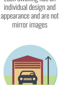
Garage, carport or shed does not exceed 4.2m height and may be sited within side and rear boundary setbacks, unless otherwise shown in an approved development footprint plan