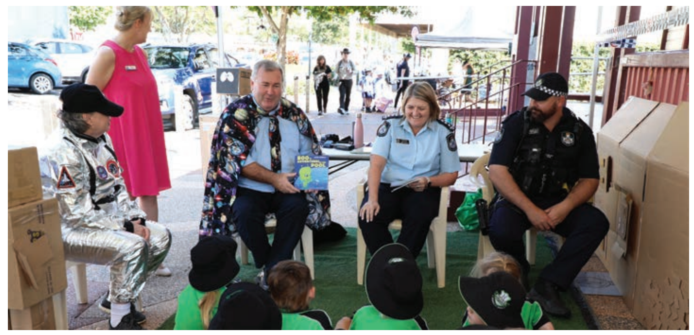
Childers Read to Me Day 2021