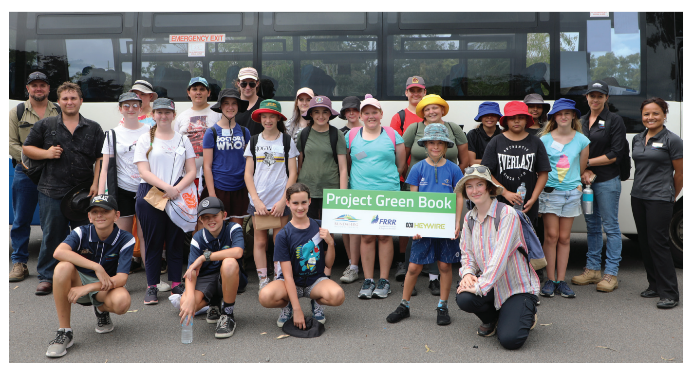
Project Green Book