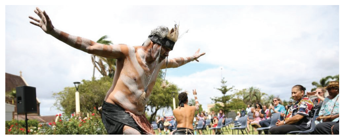
Naidoc Week Flag raising ceremony at Buss Park, Bundaberg.