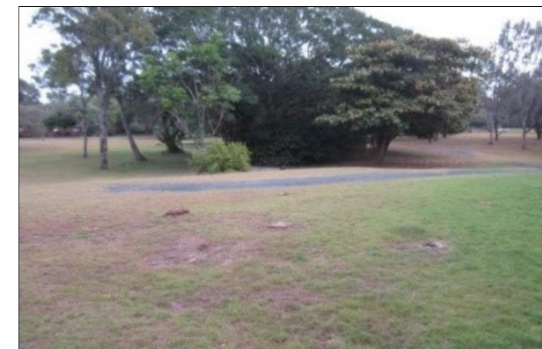
Mon Repos Cable Station remains setting, old footings visible in ground.