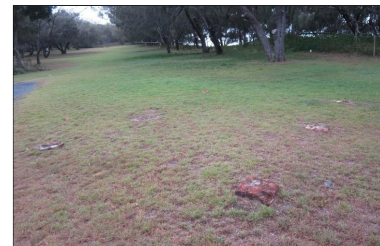
Mon Repos Cable Station remains, view to north.