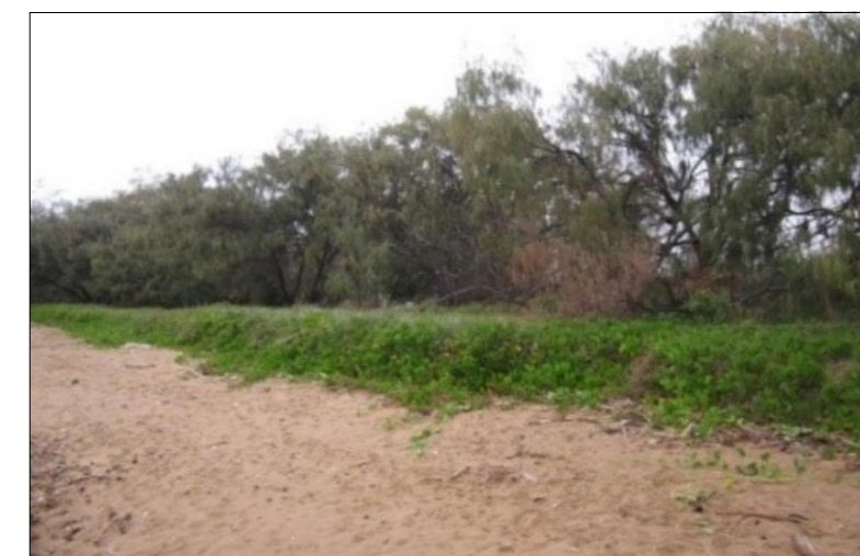
Mon Repos Beach, approximate location of cable position entry point to foreshore, view to south.